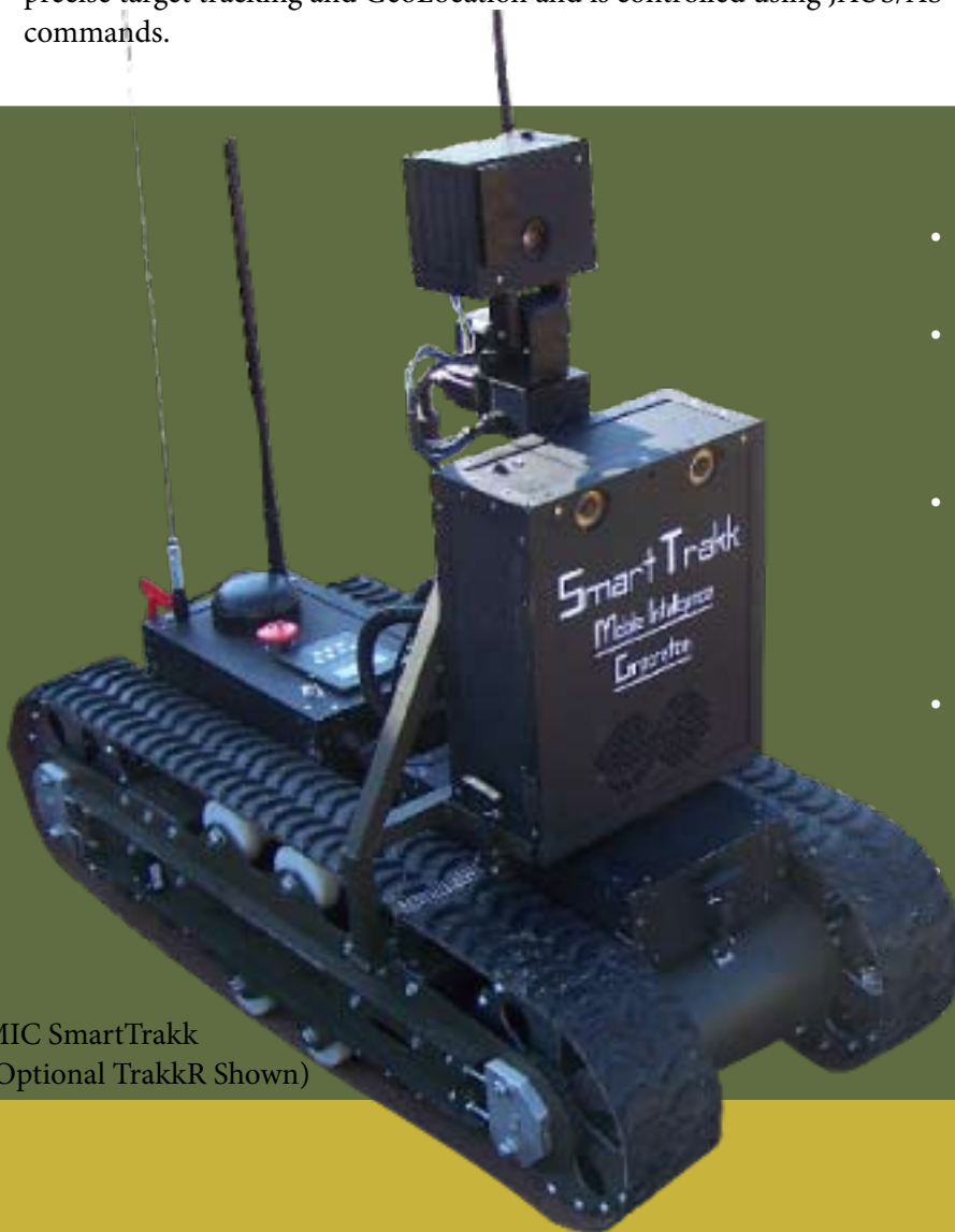
MIC SmartTrakk (Optional TrakkR Shown)

The SmartTrakk accepts JAUS/AS-4 Global Waypoint commands and communicates with the Owl, which uses a high-resolution stereo camera to build maps, avoid obstacles and plan a safe path through complex terrain. The Perch controller interfaces with the platform hardware (motor controllers and optical encoders) and manages robot localization using an inertial measurement unit, data from the motor encoders and, when available, a GPS receiver. The optional MIC TrakkR target tracker includes a pan/tilt unit housing a 40x zoom Sony Block Camera, combined with a fixed-beam laser range finder for precise target tracking and GeoLocation and is controlled using JAUS/AS-4 Camera Pose and Capability commands.